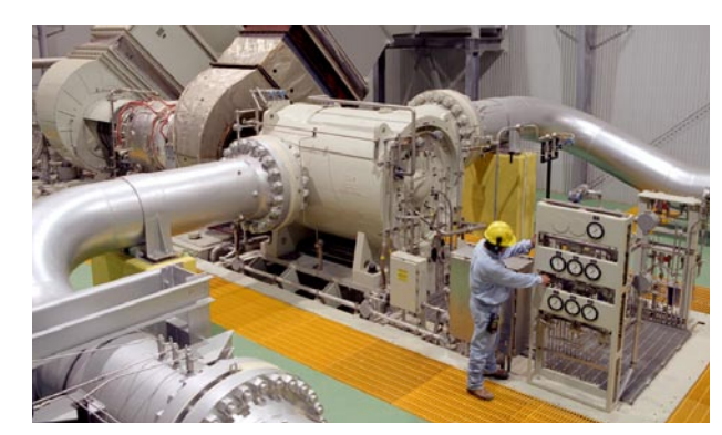
Titan Compressor Set with C65 Compressor

Solar also manufactures a broad range of rugged centrifugal compressors designed specifically to