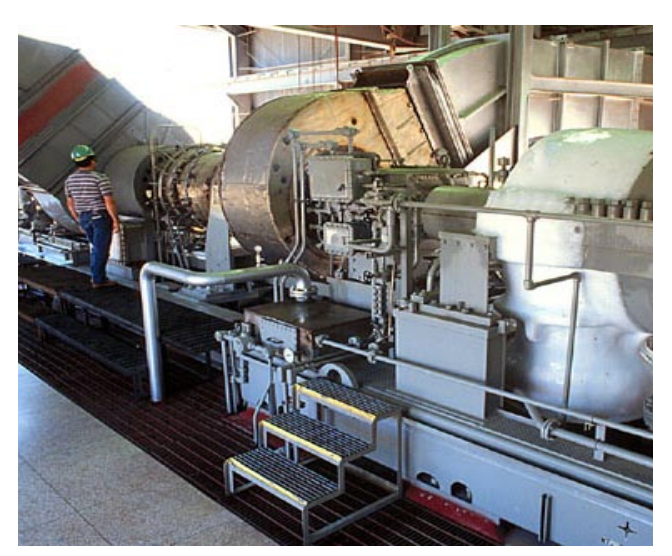
Mars Gas Turbine Mechanical-Drive Package

The gas compressors have from 1 to 12 stages to handle flows from 5 to 1275 m³/min (150 to 45,000 ft³/min) and discharge pressures to 20 700 kPa (3000 psi). They may be driven, either directly or through a gearbox, by Solar's gas turbines or by electric motors. With two or three compressors mounted in tandem, the package can provide pressure ratios up to 40:1.