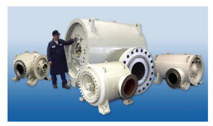
Solar Centrifugal Gas Compressors

The gas compressors have from 1 to 12 stages to handle flows from 5 to 1275 m³/min (150 to 45,000 ft³/min) and discharge pressures to 20 700 kPa (3000 psi). They may be driven, either directly or through a gearbox, by Solar's gas turbines or by electric motors. With two or three compressors mounted in tandem, the package can provide pressure ratios up to 40:1.